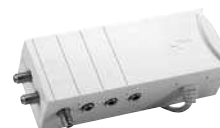
CM 01U + amp.